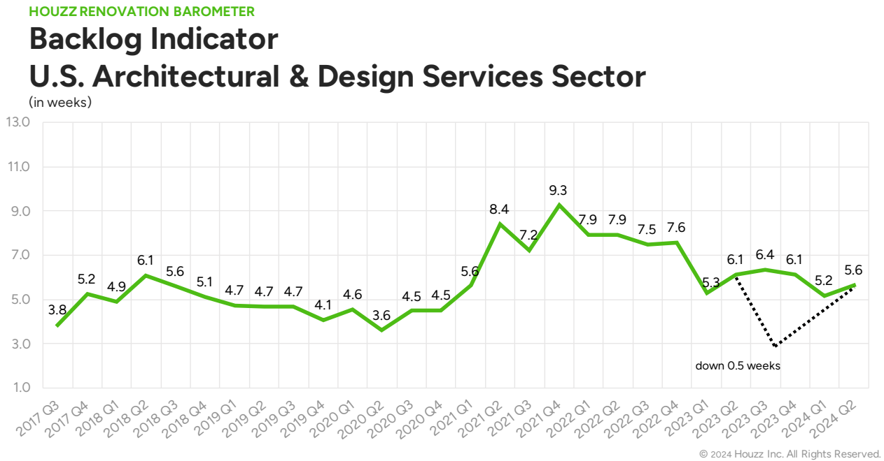
Figure 2: Houzz Renovation Barometer - Backlog Indicator, Subsectors