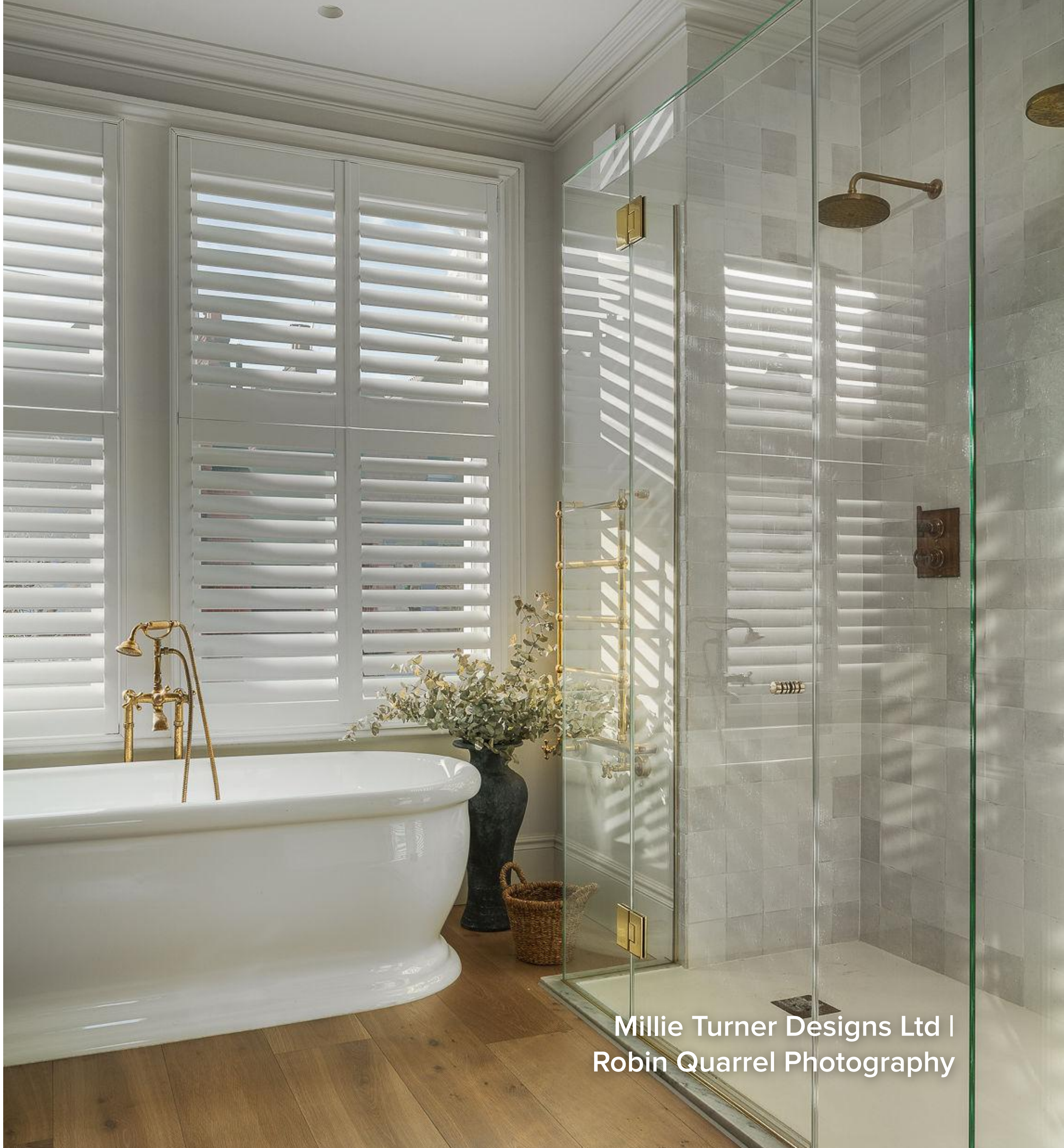
Millie Turner Designs Ltd