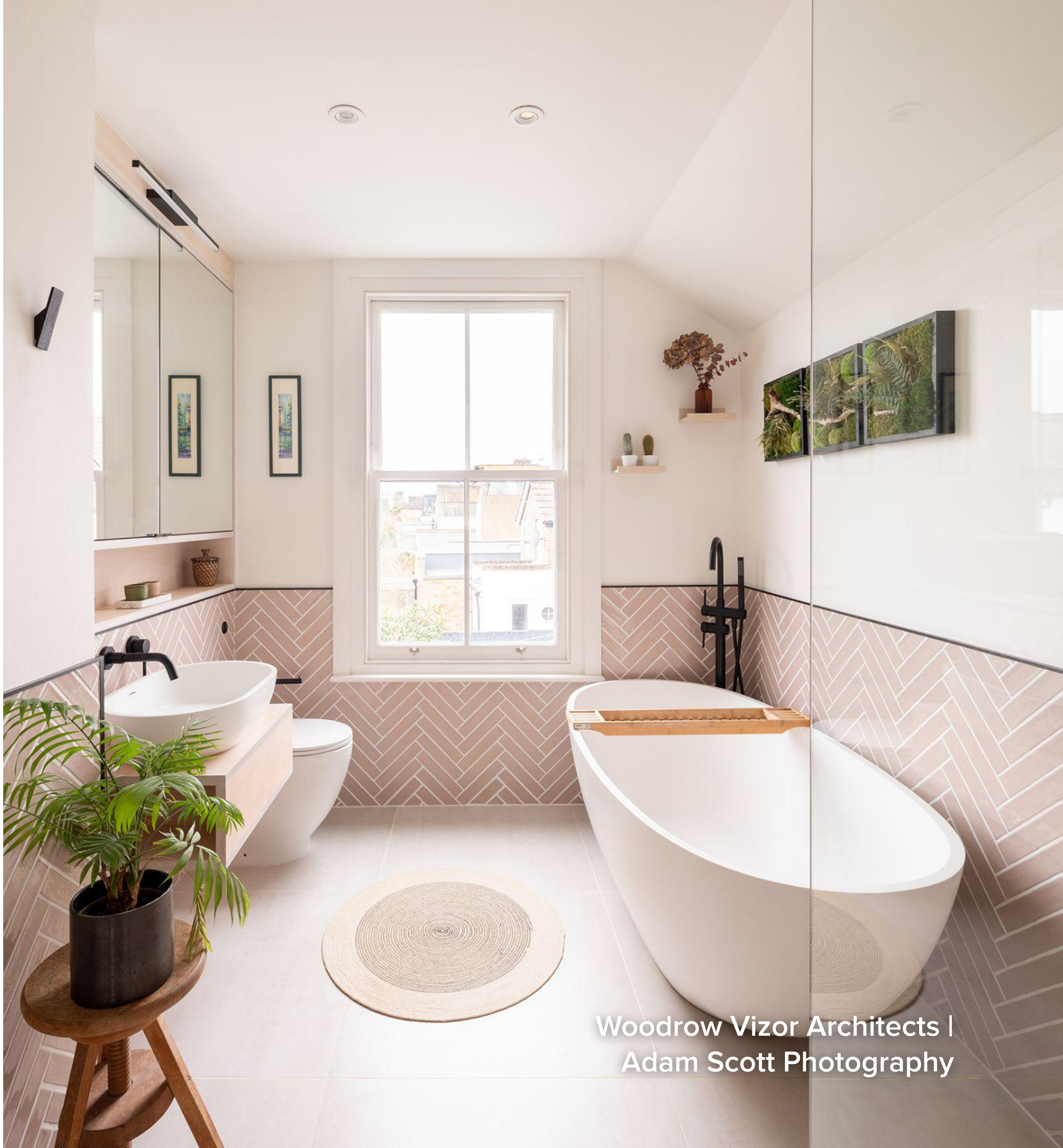
Woodrow Vizor Architects