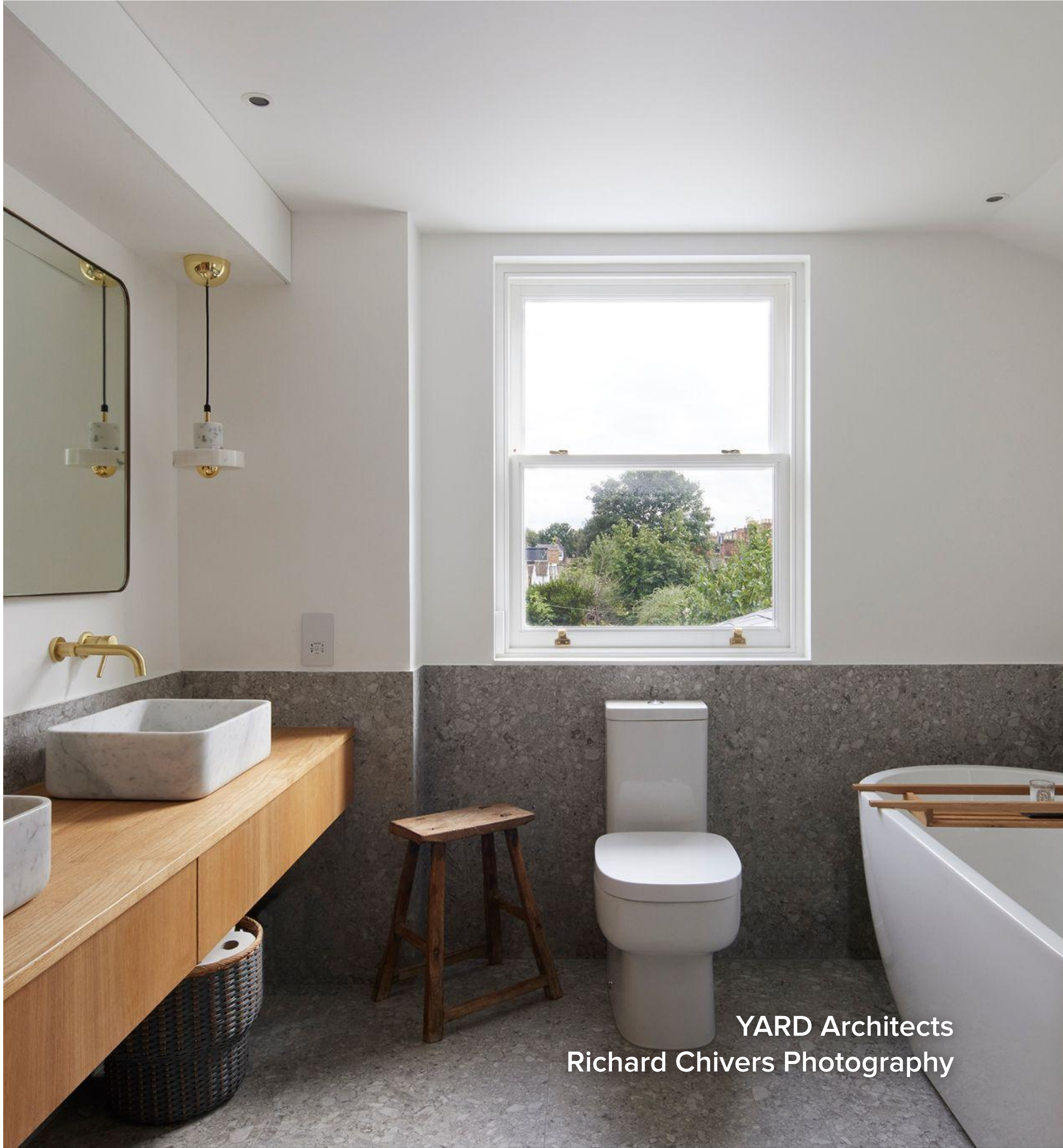
YARD Architects