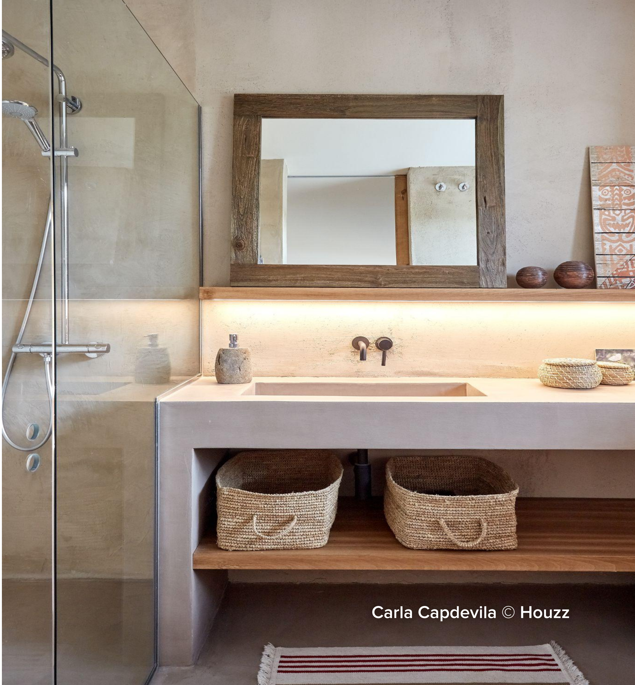
Carla Capdevila © Houzz