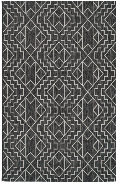
SLR03-38 | Charcoal