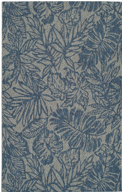
SLR04-22 | Navy