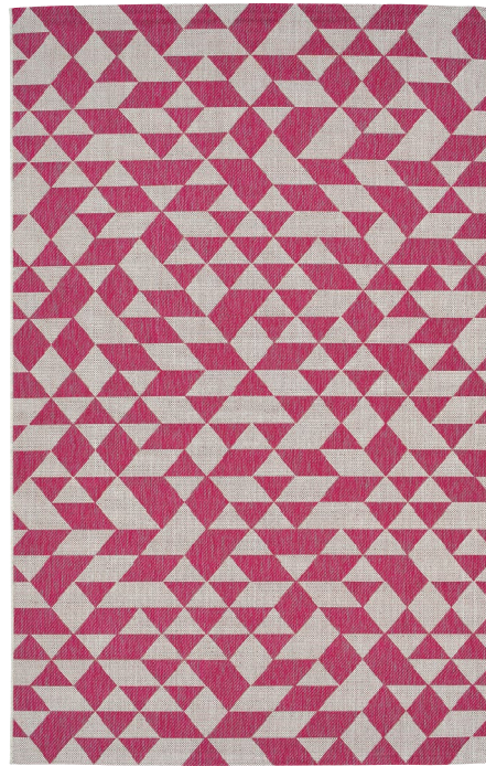
SLR06-92 | Pink