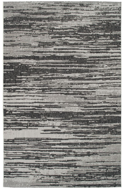
SLR05-38 | Charcoal