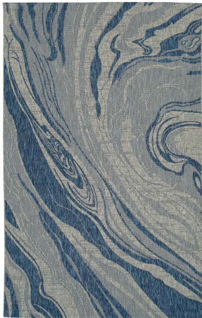
SLR07-22 | Navy