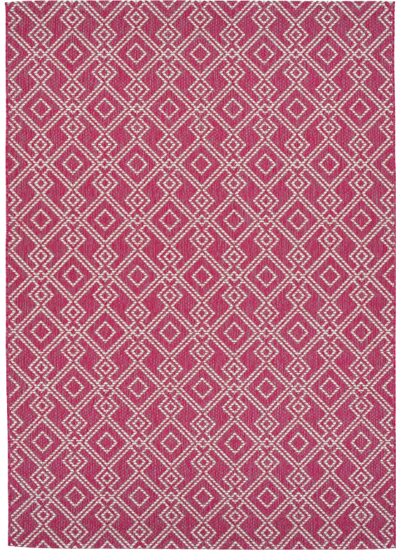
SLR01-92 | Pink