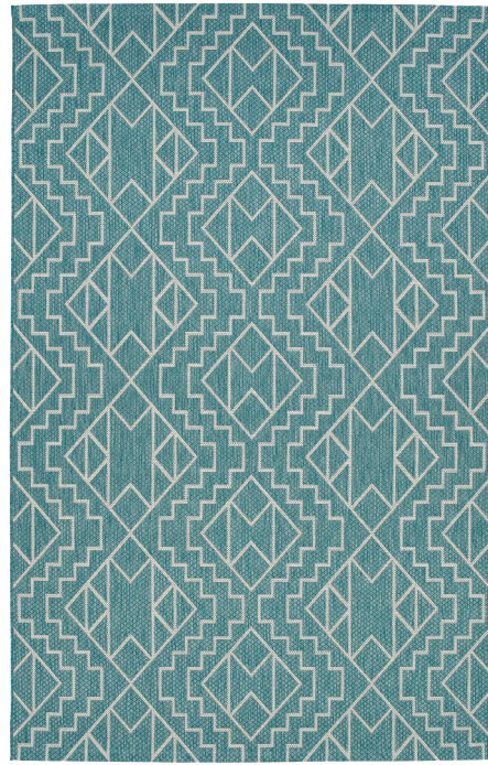
SLR03-78 | Turquoise