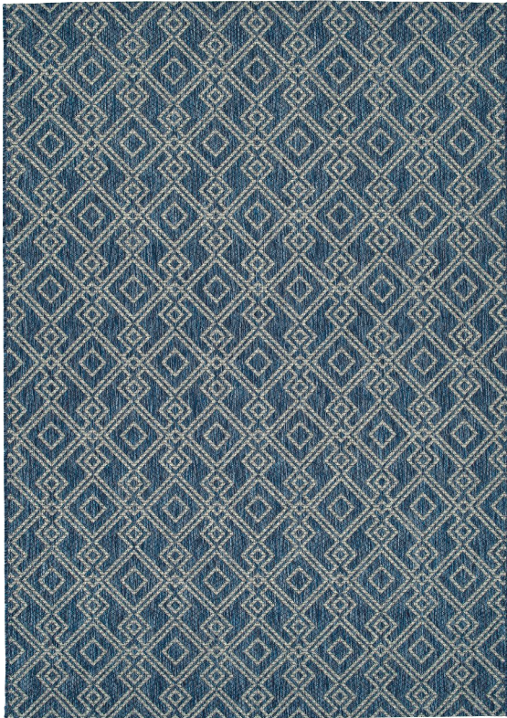
SLR01-22 | Navy