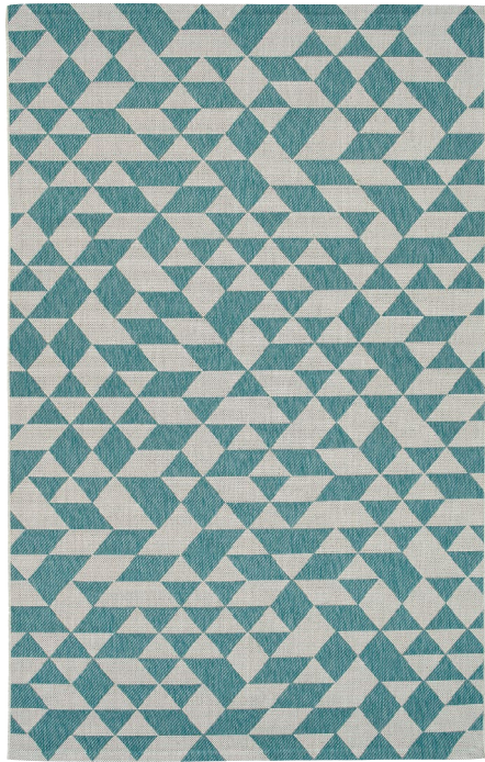
SLR06-91 | Teal