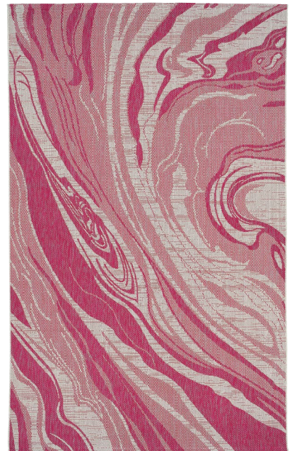
SLR07-92 | Pink