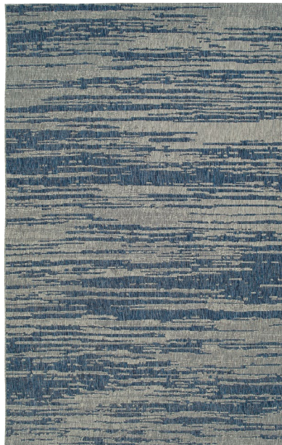
SLR05-22 | Navy