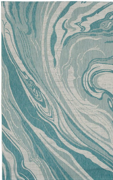
SLR07-91 | Teal