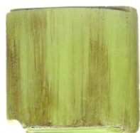
Fountain Back Door 1x