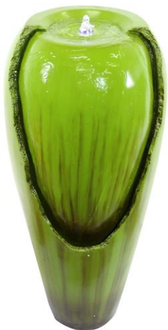
Fountain (LED lights pre-installed) 1x