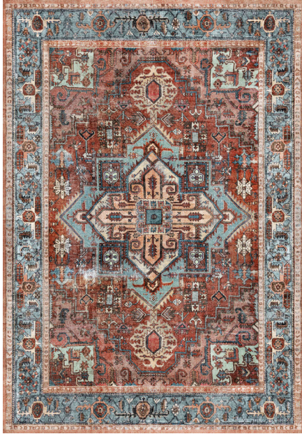
VER01-79 | Light Blue