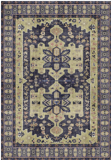
VER03-95 | Purple