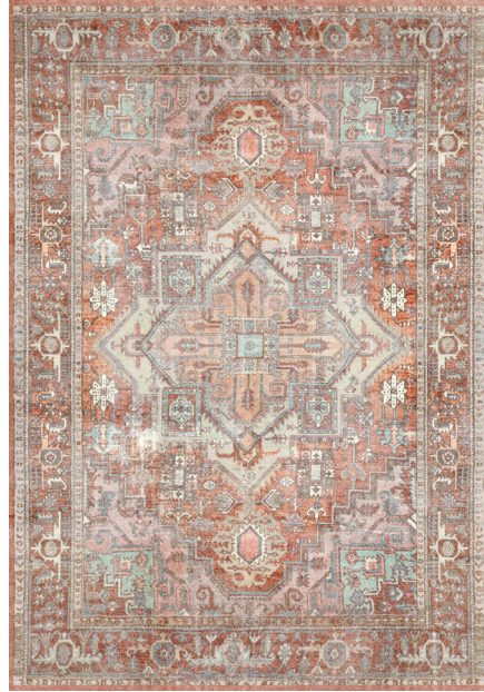
VER01-99 | Coral