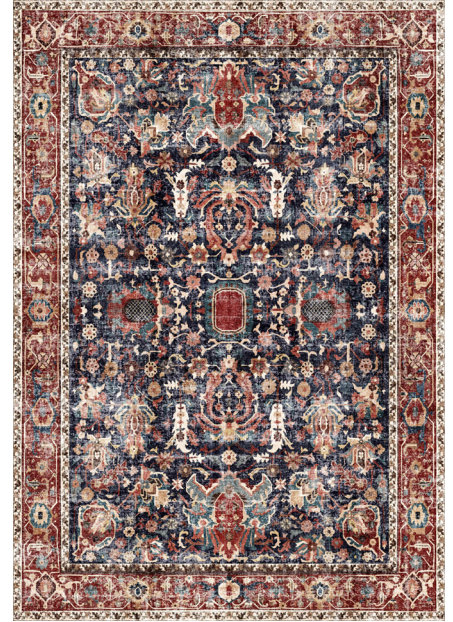
VER02-86 | Multi