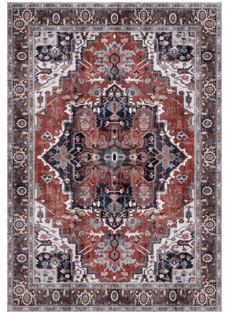
VER05-86 | Multi