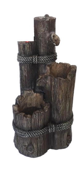
Fountain Base 1x