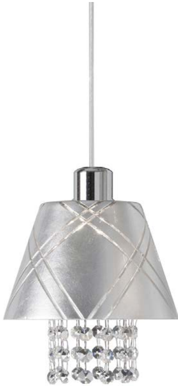
1 Light Polished Chrome Pendant with Silver Leaf Shade Clear Crystal

Height 7 Width/Length 6.5 Depth 6.5 Weight 3