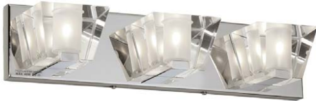
3 Light Vanity, Polished Chrome, Optical Crystal Shade

Height 5 Width/Length 17.5 Depth 3.75 Weight 5.5