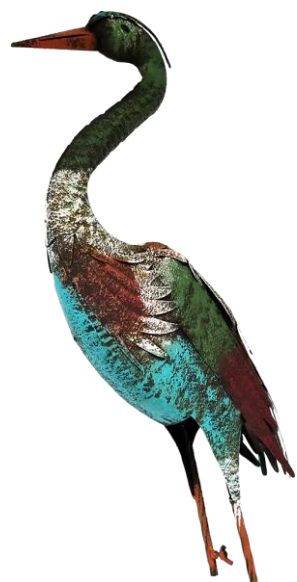
Crane Body 1x