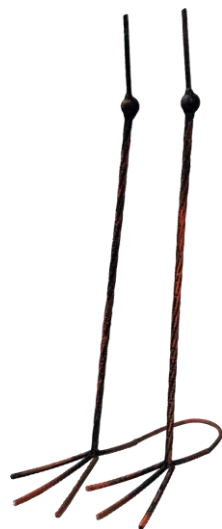
Crane Legs 1x