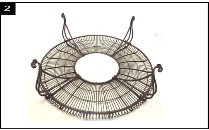
<u>Step 2</u> Combine the four legs (B) with seat part(A) by nuts(D) provided.