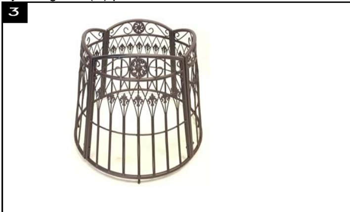
<u>Step 3</u> Combine the four back panels(D) together by nuts provided.