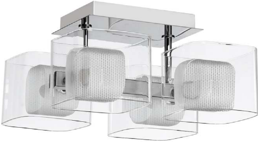
4 Light Satin Chrome Pendant Clear Glass Shade with Mesh Insert

Height 5 Width/Length 12 Depth 11 Weight 6