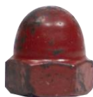
Acorn Nut 8x