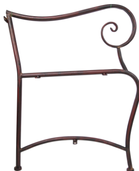
Side Arm 2x