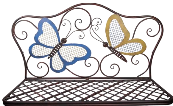
Backrest & Seat 1x