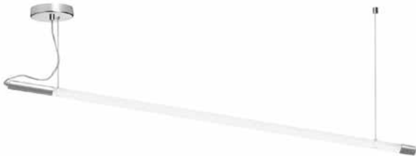
Light Stick Pendant Satin Chrome/White

Height 1.5 Width/Length 53 Depth 1.5 Weight 3