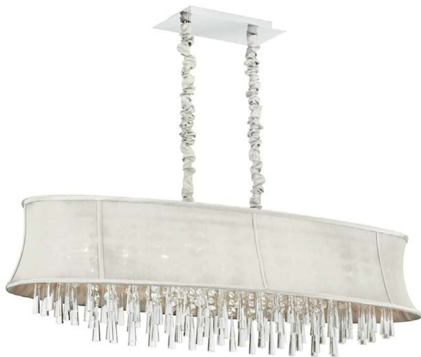
8 Light Oval Crystal Chandelier, Polished Chrome, Oval Pearl Bell Shade

Height 13 Width/Length 15 Depth 40 Weight 29