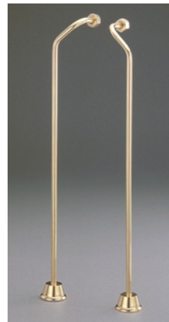
#35576 Offset Water Supply Lines