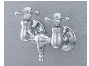
#3100 Tub Filler