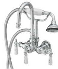
#3107 Tub Filler with Hand Shower