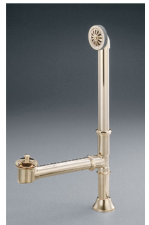
#2222 Waste & Overflow