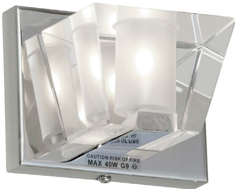
1 Light Sconce, Polished Chrome, Optical Crystal Shade

Height 5 Width/Length 5.25 Depth 3.75 Weight 4.5