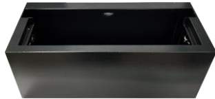
Fountain Base 1x