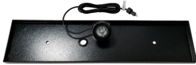
Fountain Tray with Light 1x