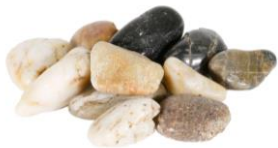
Bag of Rocks 1x