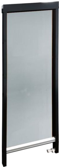
Fountain Top 1x