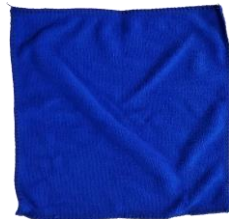
Cleaning Cloth 1x