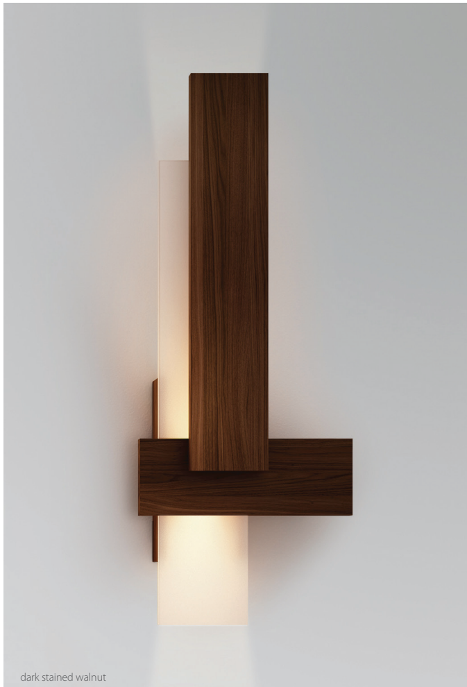
dark stained walnut

The Sedo is composed of just three floating planes all kept parallel to the wall. This simple composition cloaks the light engine from view and filters the light as it is delivered far up and down the wall. It's this wall grazing and diffuser glow that gives the Sedo a strong architectural presence.