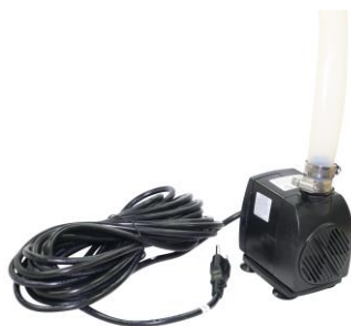
Fountain Pump 1x