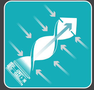
Extreme Negative-Pressure Airflow Promotes Whole Room Air Circulation