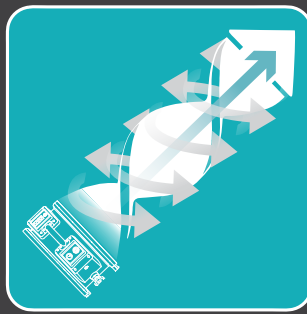
Large Torque Motor Creates Focused & Extended Airflow Up To 190Ft