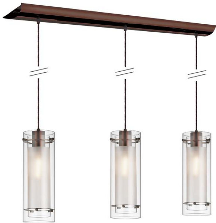
3 Light Horizontal Pendant, Oil Brushed Bronze Finish, Clear Frosted Glass

Height 15 Width/Length 5 Depth 5 Weight 16