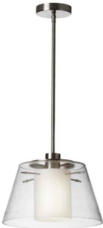
1 Light Pendant, Polished Chrome, Clear Glass and White Frosted Glass

Height 8.5 Width/Length 13 Depth 13 Weight 7