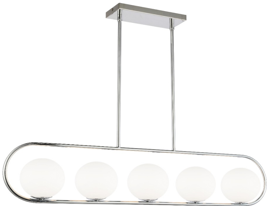
5 Light Halogen Horizontal Pendant Polished Chrome Finish with White Glass

Height 10 Width/Length 40 Depth 5.5 Weight 11