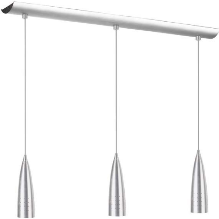
3 Light Horizontal Pendant, Satin Chrome

Height 10 Width/Length 2.5 Depth 4.5 Weight 8