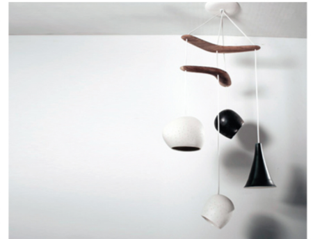
Day light image