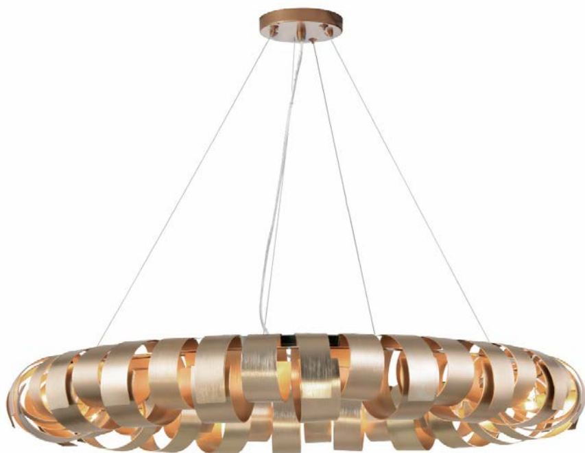
8 Light Pendant, Champagne Aluminum Ribbons

Height 5.5 Width/Length 28 Depth 28 Weight 13