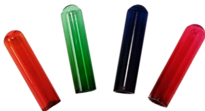
Color Lenses 4x