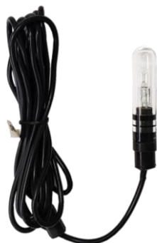
Light Strand 1x