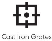
Cast Iron Grates