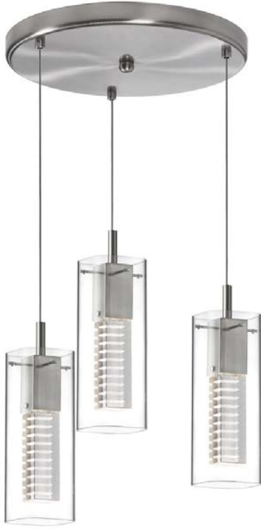
3 Lite Satin Chrome Crystal Round Pendant 4' Clear Silver Cord

Height 9.5 Width/Length 3 Depth 12 Weight 12