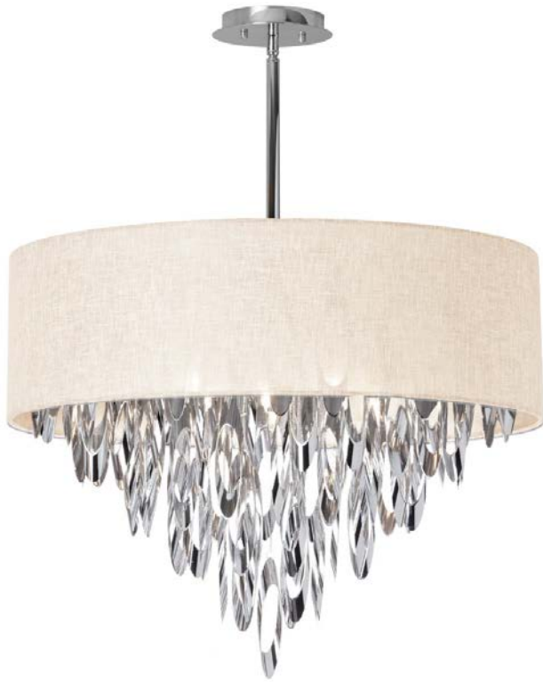
8 Light Chandelier with Cream Shade

Height 20 Width/Length 24 Depth 24 Weight 13