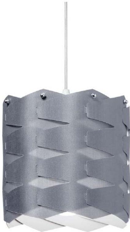
1 Light Cross Hatch Pendant, Polished Chrome

Height 9 Width/Length 8 Depth 8 Weight 6