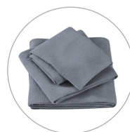
soft dry cloth