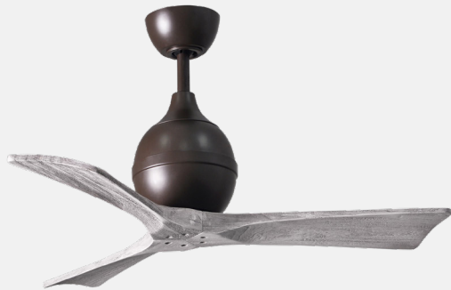
IR3-TB-BW-42 Textured Bronze Finish, with 42” Barn Wood Tone Blades