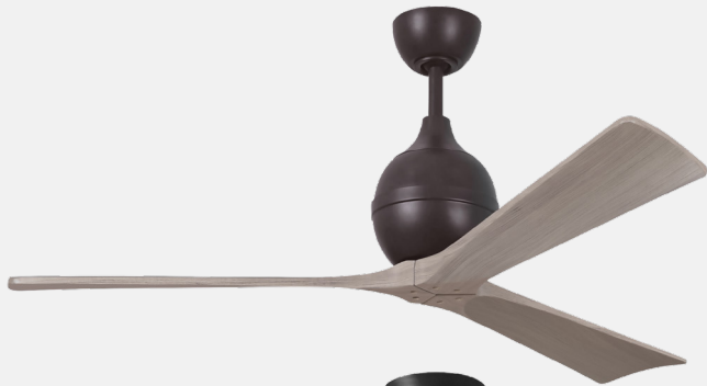
IR3-TB-GA-60 Matte Black Finish, with 60” Gray Ash Tone Blades