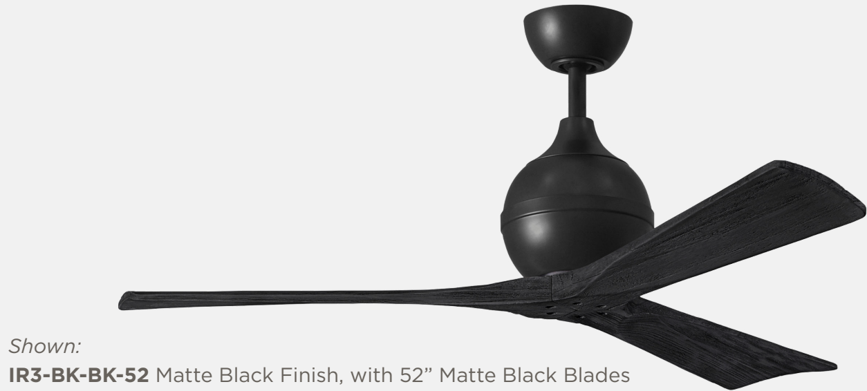
Shown: IR3-BK-BK-52 Matte Black Finish, with 52” Matte Black Blades