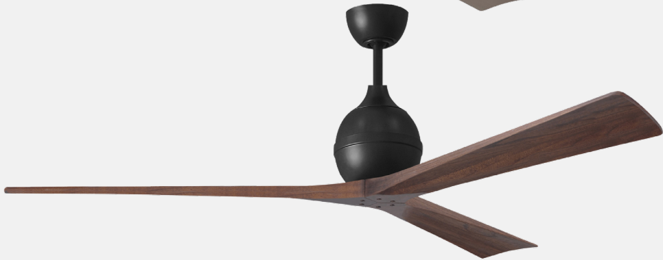
IR3-BK-WA-72 Matte Black Finish, with 72” Walnut Tone Blades