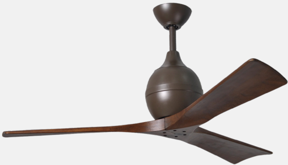
IR3-TB-WA-52 Textured Bronze Finish, with 52” Walnut Tone Blades