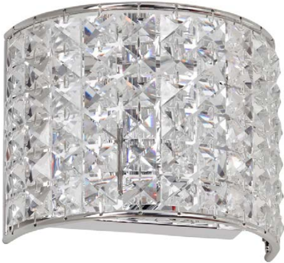
1 Light Crystal Sconce, Polished Chrome

Height 5.5 Width/Length 6 Depth 3 Weight 2