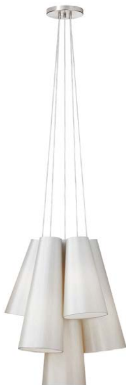
5 Light Cluster Pendant with 5 Shades, Satin Chrome Canopy

Height 48 Width/Length 22 Depth 22 Weight 18