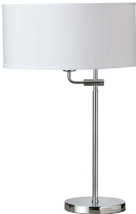
Adjustable Table Lamp, Polished Chrome, White Shade

Height 34 Width/Length 15 Depth 15 Weight 10