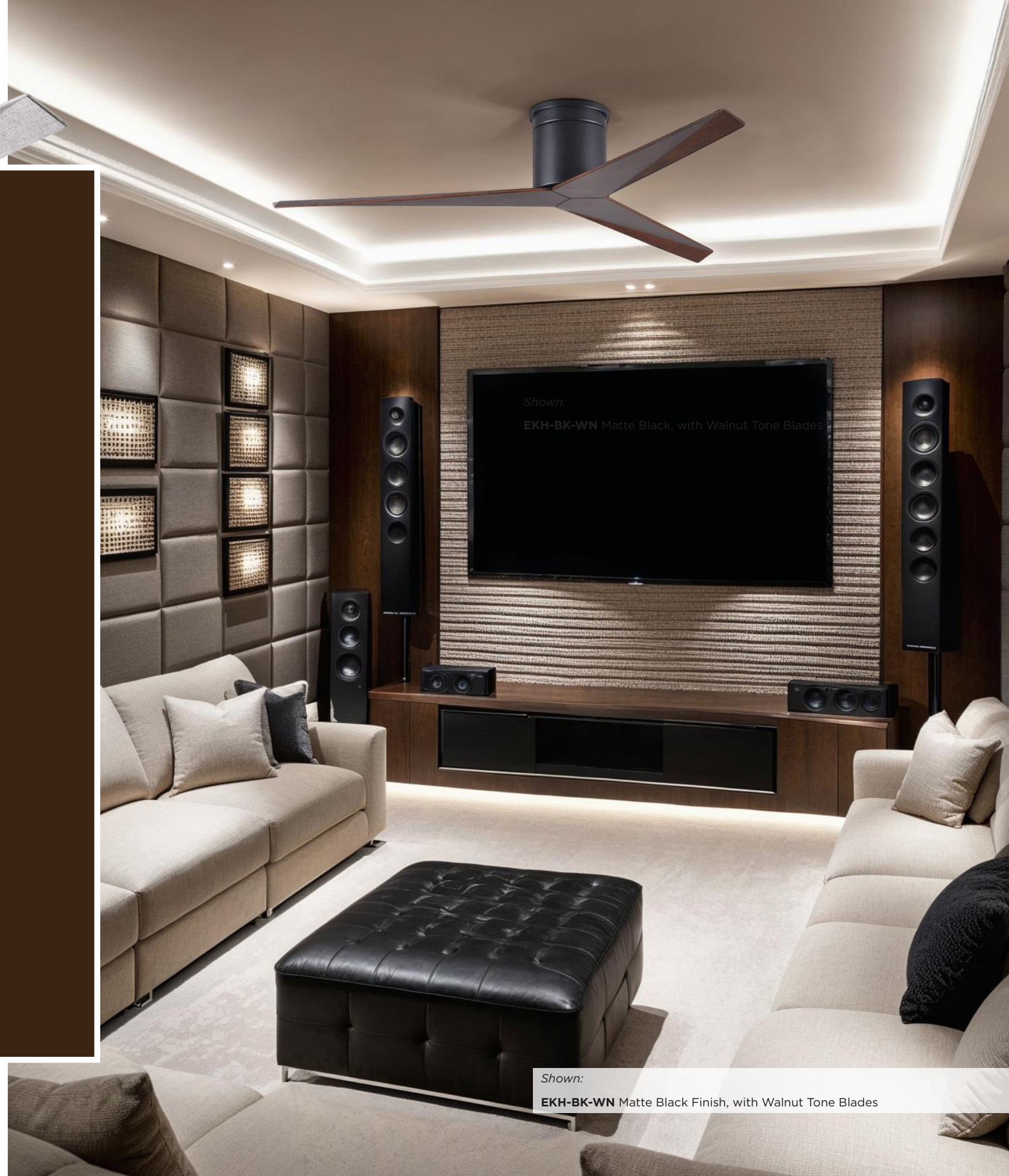
Shown: EKH-BK-WN Matte Black Finish, with Walnut Tone Blades