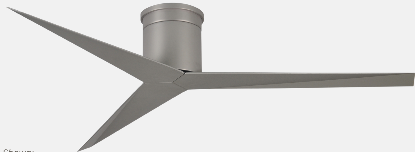
Shown: EKH-BN-BN Brushed Nickel Finish, Brushed Nickel Blades