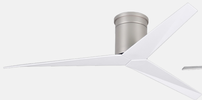
EKH-BN-WH Brushed Nickel Finish, with Gloss White Blades