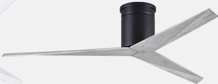
EKH-BK-BW Matte Black Finish, with Barn Wood Tone Blades