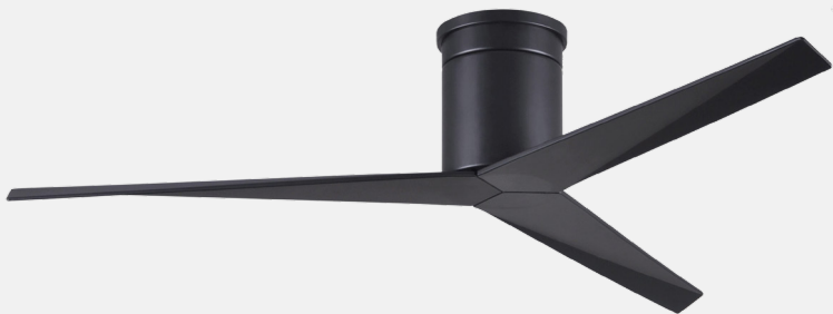
EKH-BK-BK Matte Black Finish, with Matte Black Blades