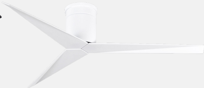
EKH-WH-WH Gloss White Finish, with Gloss White Blades