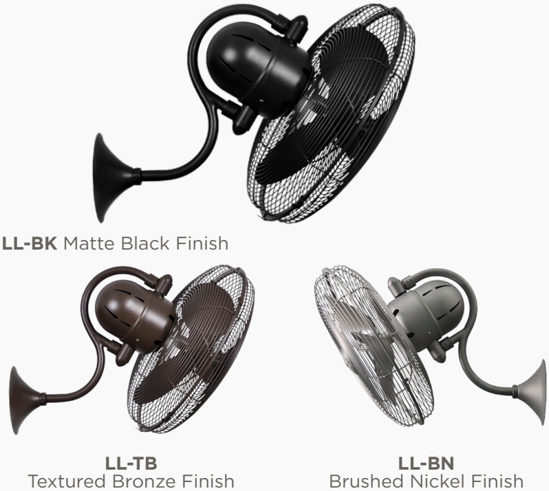
LL-BK Matte Black Finish