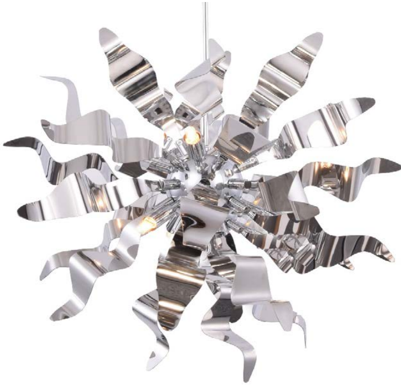
8 Light Pendant with Wavelet Ribbons, Polished Chrome Finish

Height 26 Width/Length 26 Depth 26 Weight 12