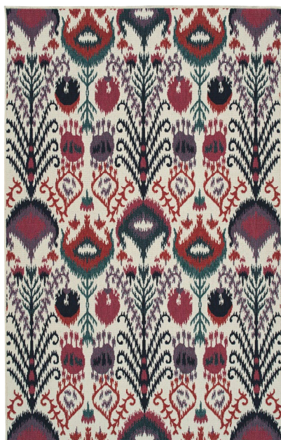
BTK05-01 | Ivory