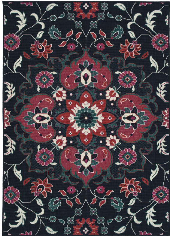
BTK03-22 | Navy