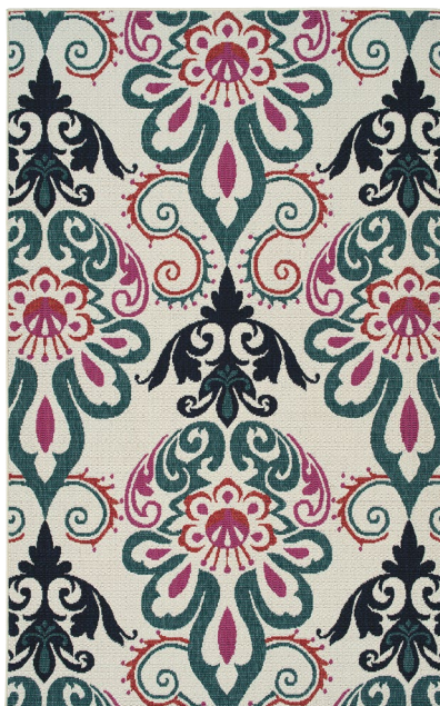
BTK04-01 | Ivory