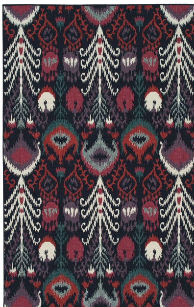
BTK05-22 | Navy