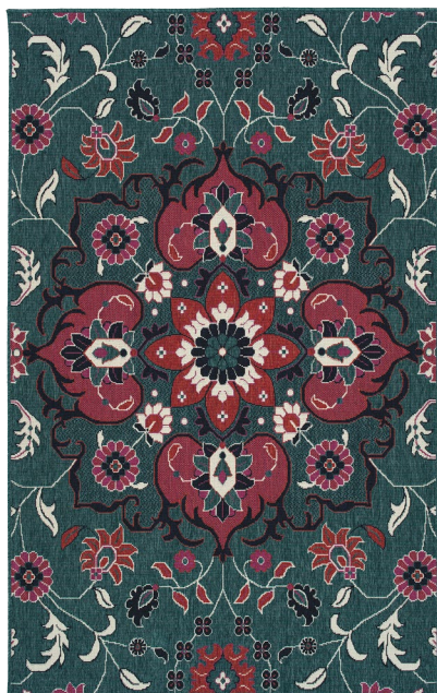
BTK03-91 | Teal