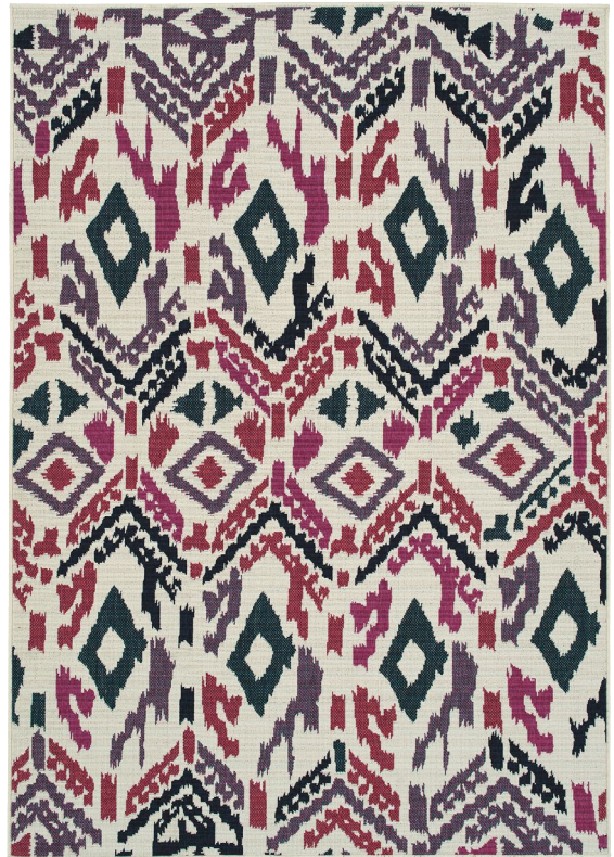
BTK02-01 | Ivory