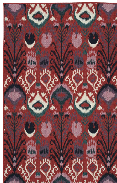
BTK05-25 | Red