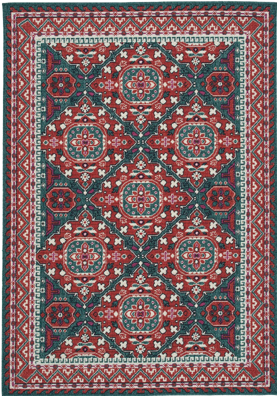
BTK01-25 | Red