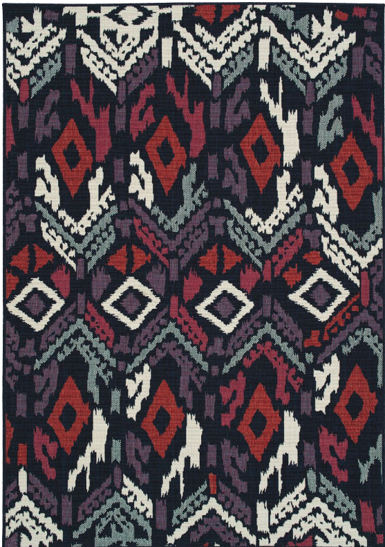
BTK02-22 | Navy