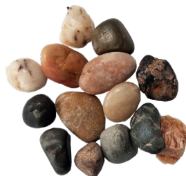
Bag of Rocks 1x