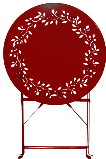
Bistro Table 1x