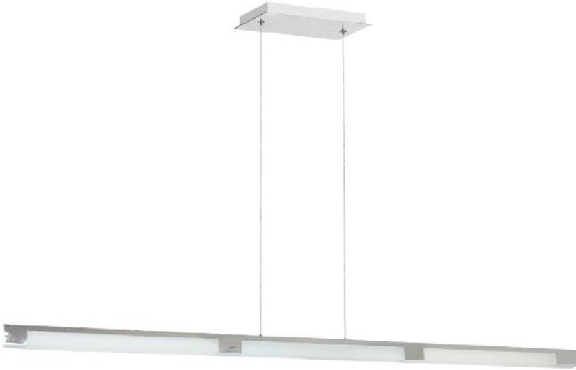
LED Pendant, Polished Chrome Finish

Height 1.5 Width/Length 42 Depth 1 Weight 6