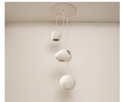
Day light image