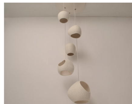
Day light image