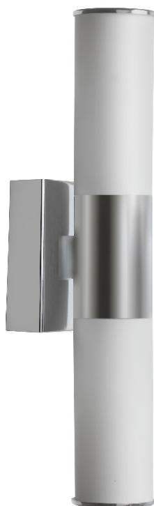
2 Light LED Wall Sconce, Satin Chrome, White Frosted Glass

Height 19.5 Width/Length 4.5 Depth 4 Weight 5