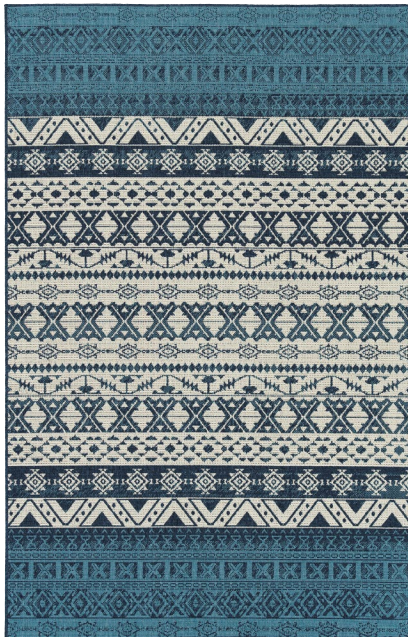
SUN08-22 | Navy