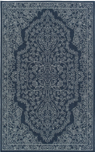
SUN12-22 | Navy