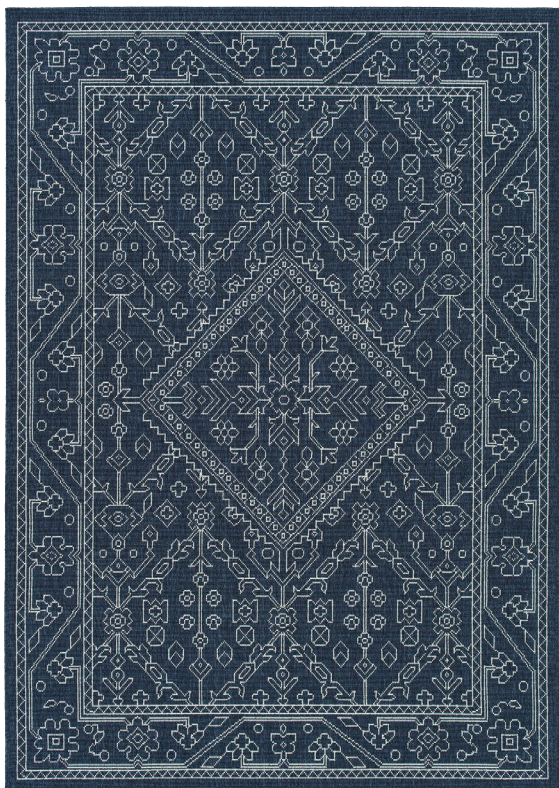
SUN17-22 | Navy