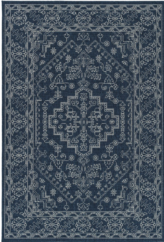
SUN01-22 | Navy