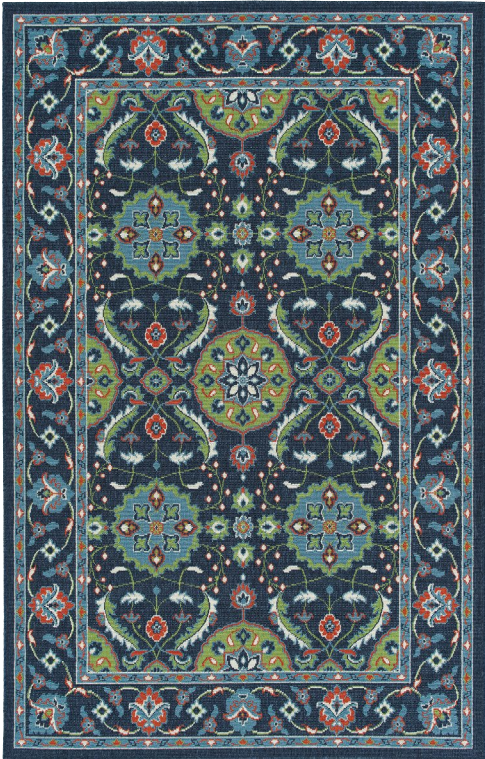
SUN11-22 | Navy