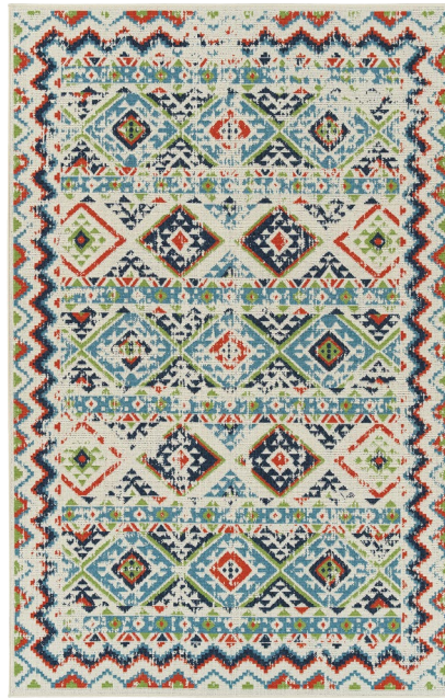
SUN09-01 | Ivory