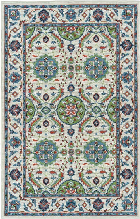
SUN11-01 | Ivory