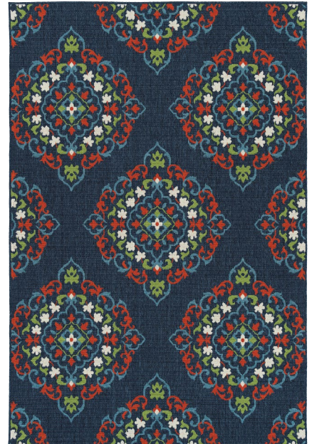
SUN05-22 | Navy