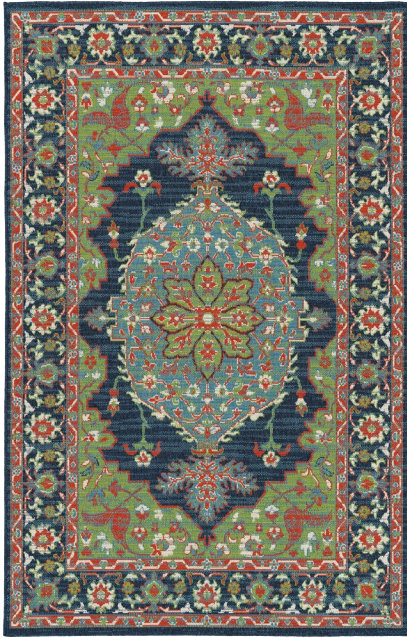
SUN06-96 | Lime Green