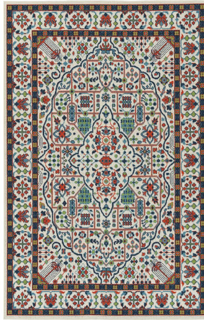
SUN07-01 | Ivory