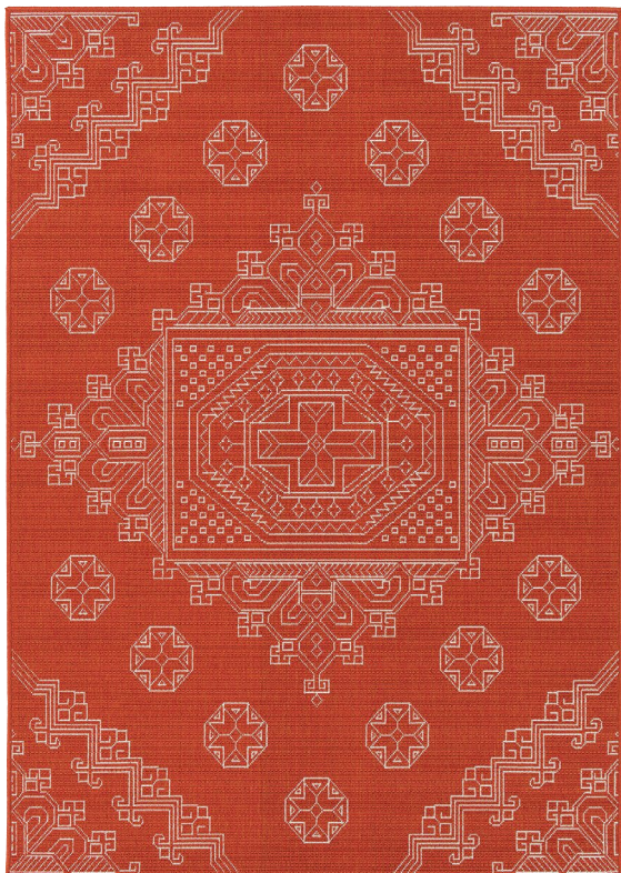
SUN15-32 | Tangerine