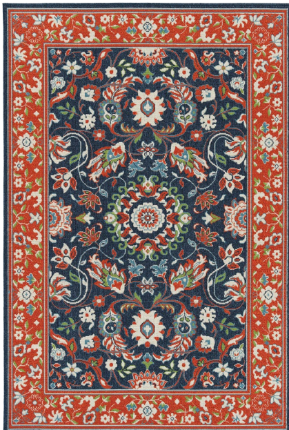
SUN03-32 | Tangerine