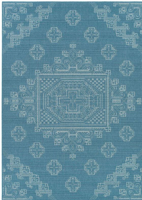
SUN15-79 | Light Blue