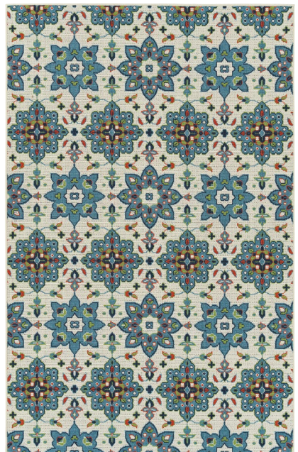
SUN10-79 | Light Blue