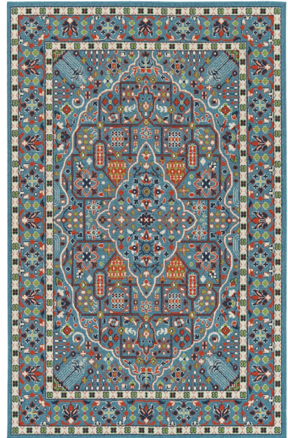
SUN07-79 | Light Blue