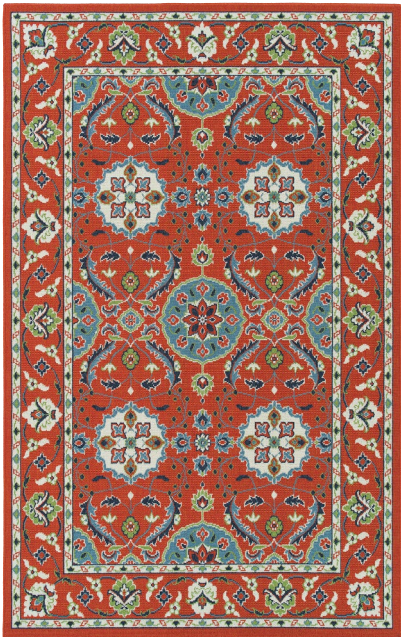
SUN11-32 | Tangerine