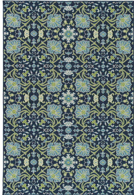
SUN01-22 | Navy