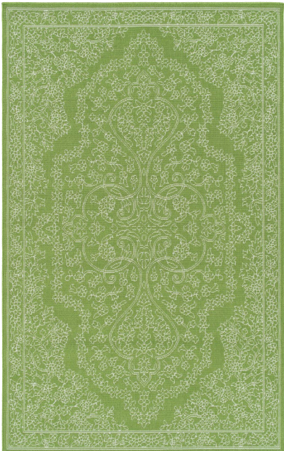
SUN12-96 | Lime Green