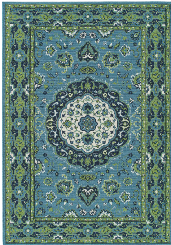
SUN13-79 | Light Blue