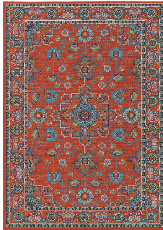
SUN16-32 | Tangerine