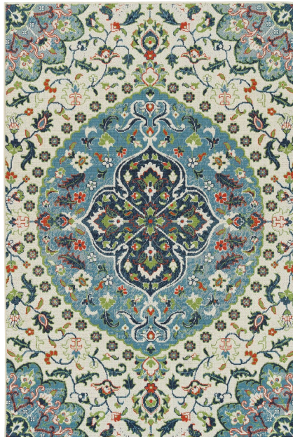
SUN04-01 | Ivory