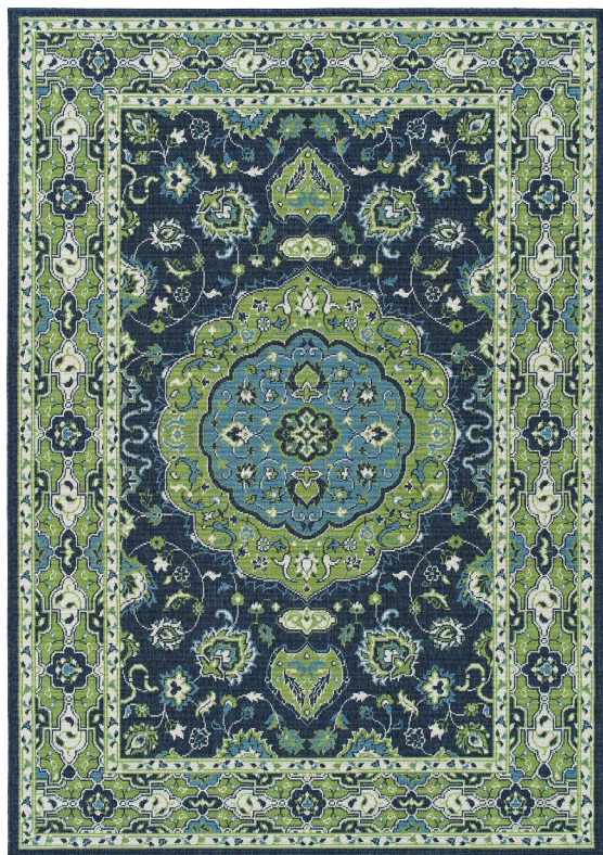
SUN13-22 | Navy