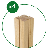
11 in. x 2.5 in. x 2.5 in. Tall Posts