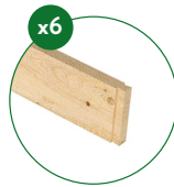
4 ft. x 3.5 in. Boards