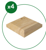
3.5 in. x 3.5 in. Decorative Caps