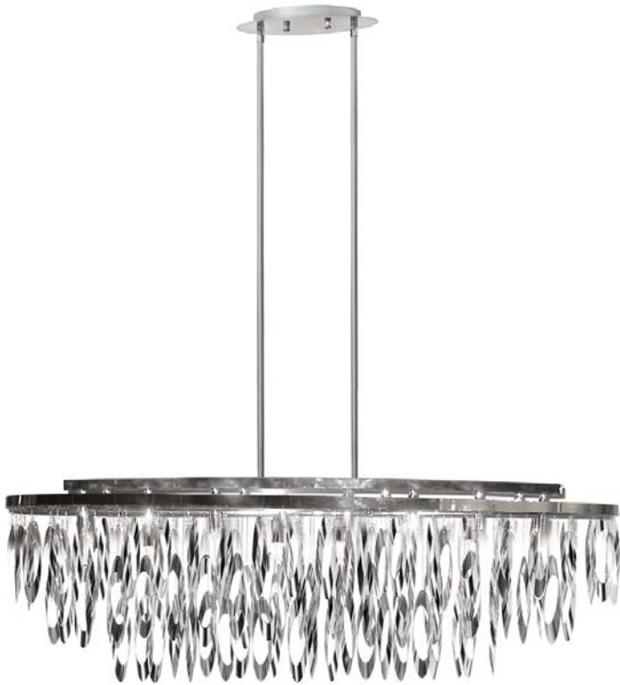
8 Light Oval Chandelier Polished Chrome Finish

Height 15 Width/Length 39 Depth 13 Weight 14