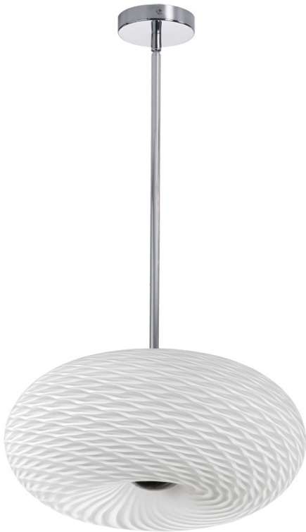
3 Light Mackerel Glass Pendant, Satin Chrome

Height 8 Width/Length 15 Depth 15 Weight 6.9